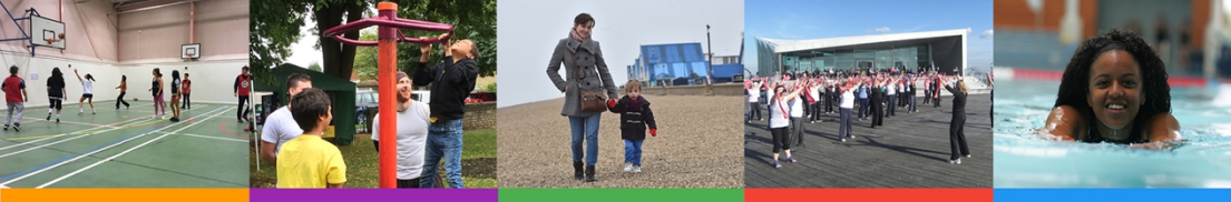
Figure 1. What constitutes physical activity